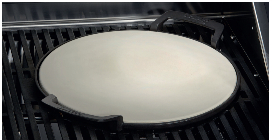
SWITCH GRID PIZZA STONE