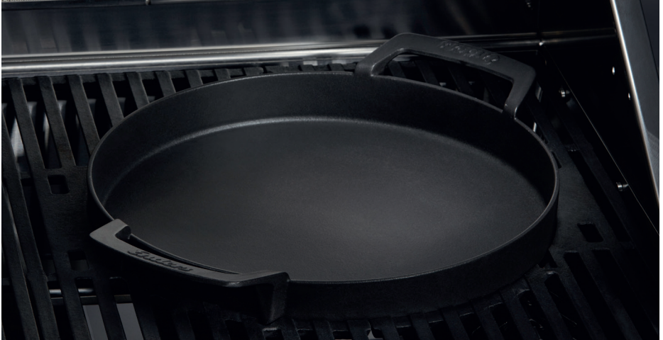
SWITCH GRID PAN