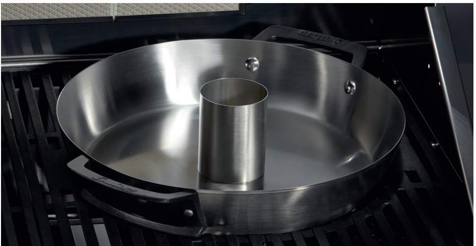
SWITCH GRID POULTRY ROASTER