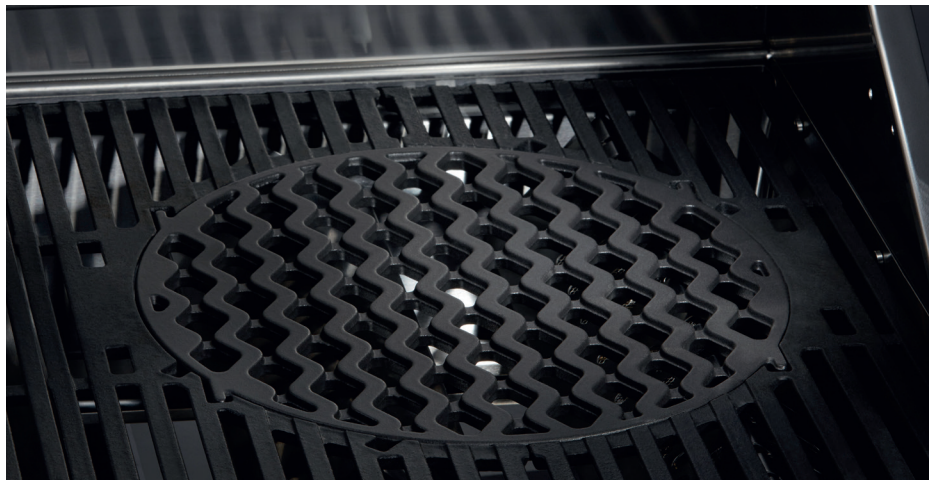
SWITCH GRID SEAR GRATE