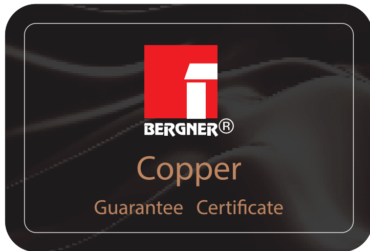
guarantee card front side